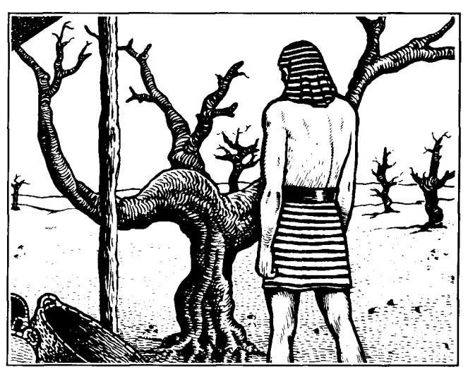
Pharaoh's dream revealed that Egypt would be stricken with seven years of severe famine.

After carefully considering the matter, and deciding that Joseph's advice was good, Pharaoh asked his advisors, "Where can we find such a man as this to oversee our farming? What better man could there be but Joseph, in whom the Spirit of God dwells?" They agreed that Joseph should do the job.