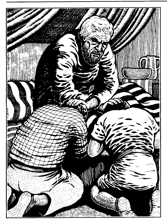
Israel asked God to greatly bless his grandsons, Ephraim and Manasseh.

would become. The forty-ninth chapter of Genesis records the prophetic words God inspired Israel to speak. Read this chapter with your parents and discuss the meaning of the prophetic remarks Israel made about each of his sons.